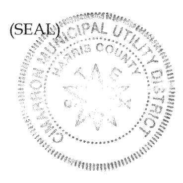
Secretary, Board of Directors

Witness my hand and seal of the District the 20th day of March, 2019.